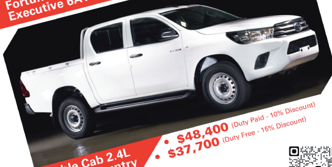
Hilux Double Cab 2.4L GD-6 4x4 6MT Country

• $96,300 (Duty Paid - 10% Discount) • $64,600 (Duty Free - 20% Discount)