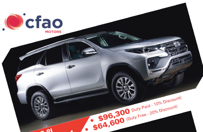
Fortuner 2.8L Executive 6AT 4x4

• $96,300 (Duty Paid - 10% Discount) • $64,600 (Duty Free - 20% Discount)